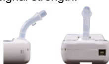
Figure 1 – Power cord Figure 2 – Mouthpiece installation